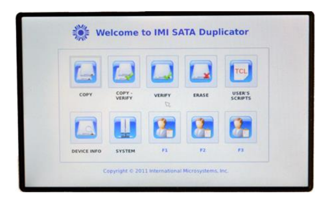
M3200 Front Panel Touch Screen Menu

The M3200 is a full featured production Duplicator for HDD's and SSD's which copies up to 15 drives simultaneously. A front panel 7" Touch screen provides full control of the M3200. Alternatively, a LCD, keyboard and mouse using a Graphic Interface allows users to define and execute simple or complex scripts while also providing network connectivity.