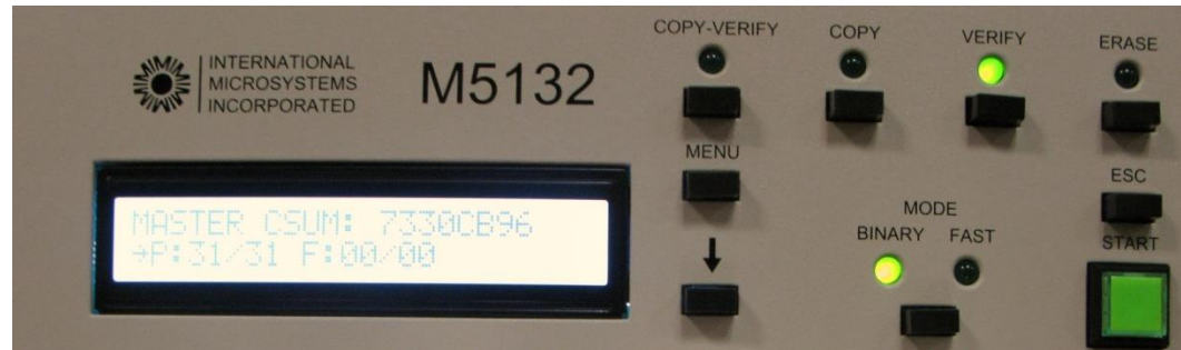
M5132 Front Panel Keyboard